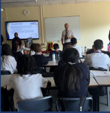
Learning the school rules