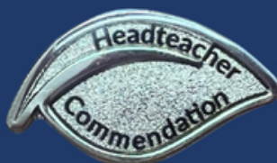
Silver Award Awarded 2nd time