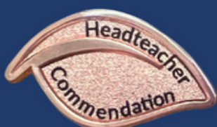
Bronze Award Awarded 1st time

Ambition - for high aspirations (mock) exam results, assessment results